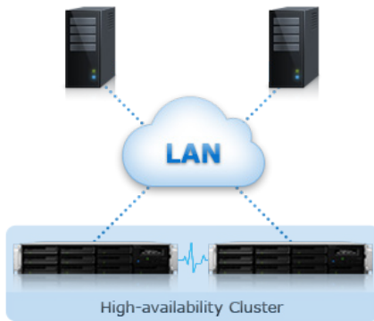
Figure 1) Reliability, Availability & Disaster Recovery

Synology High Availability Manager ensures seamless transition between clustered servers in the event of server failure with minimal impact to businesses.