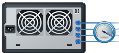
Figure 2) Superior Performance

Synology High Availability ensures seamless transition between clustered servers in the event of server failure with minimal impact to businesses.