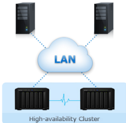
Figure 1) Reliability, Availability & Disaster Recovery

Synology High Availability ensures seamless transition between clustered servers in the event of server failure with minimal impact to businesses.