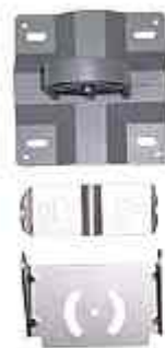
wall mount kit