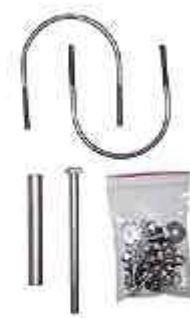
pole mount kit