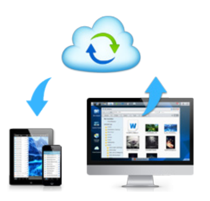
Cross-platform File Synchronization

Auto-synchronize your files among DiskStation, PC and mobile devices using Synology Cloud Station.