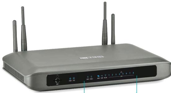
LED Indications for Power, System, WLAN, WAN and LAN Switch Ports

CNX200 facilitates small offices and branch offices with business-class IP telephony, wireless mobility, high-speed internet, enhanced security and remote site connectivity from an affordable and easy to manage platform.