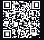
TSW200 360° VIEW

// TSW200 is industrial unmanaged switch from Teltonika Networks.