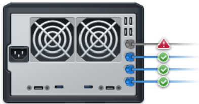
Figure 2) Resilient and Reliable

Multiple LAN ports with link aggregation support allows DS1513+ to deliver superior performance.