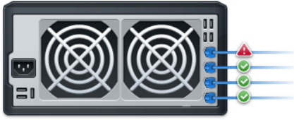
Figure 1) Resilient and Reliable

With multiple redundant LAN ports, DS1813+ is resilient enough to be entrusted with your most mission critical tasks.