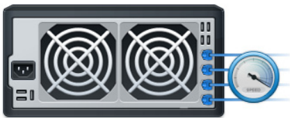
Figure 2) Superior Performance

As your data storage needs grow, Synology's DS1813+ can grow with you. The DS1813+ can be connected to dedicated expansion units for additional storage on the fly, growing capacity with minimal effort. When paired with two DX513 expansion units 2 through specially designed eSATA connectors, raw capacity can be as high as 72 TB.