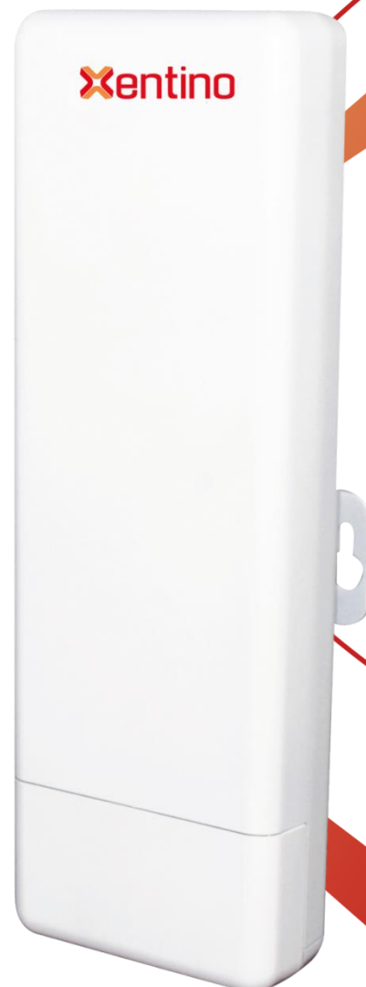
External Antenna SMA Connector